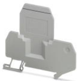
Partition plate, Length: 74.3 mm, Width: 2.2 mm, Height: 70 mm, Color: gray

Please be informed that the data shown in this PDF Document is generated from our Online Catalog. Please find the complete data in the user's documentation. Our General Terms of Use for Downloads are valid ( http://phoenixcontact.com/download )